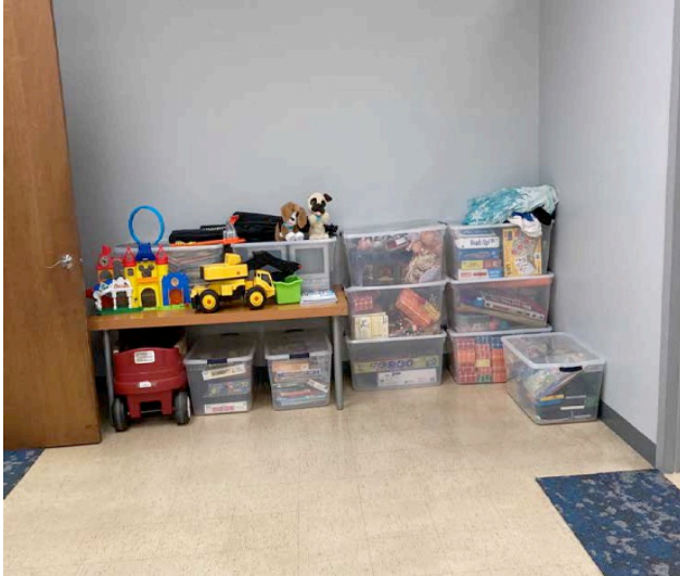
View of one of our 4 On Site Visiting Rooms