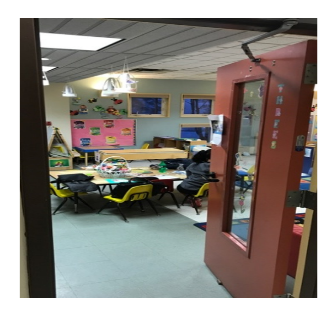
View of our activity nook